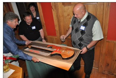
MMMM, guitar cake.... agghhh!