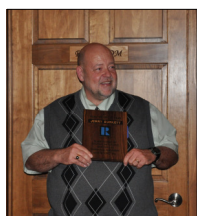
Smile for the camera! Not that way - over here!