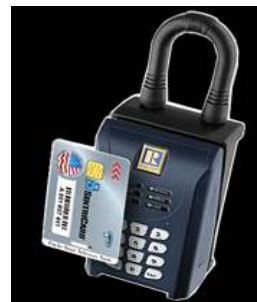
SentiLock, 2009 winner - Best Overall in Industry